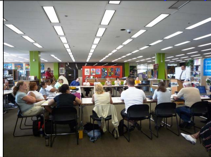
Discussions on SLC: Rigor, Relevance & Relationships