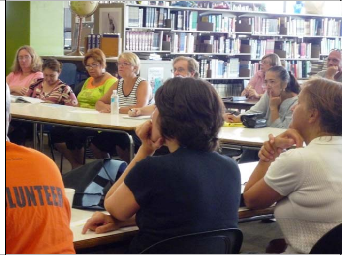
Teachers of English, Algebra, Biology, History, Music & Arts.