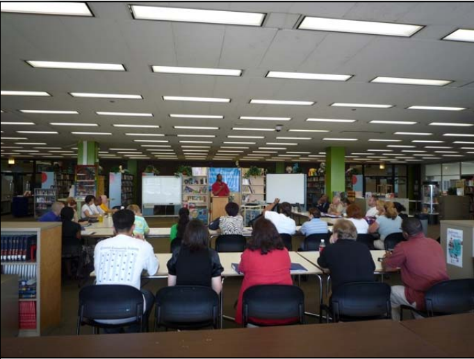
63 teachers and teacher leaders attended the 5th Annual SLC Institute—August 18, 19 & 20, 2008.