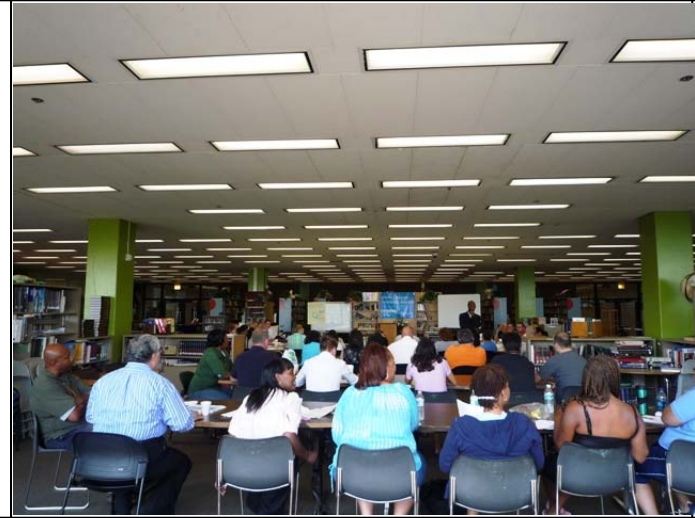
63 teachers and teacher leaders actively participated in the SLC Institute.