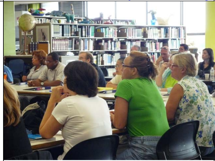
Together, we'll succeed!.