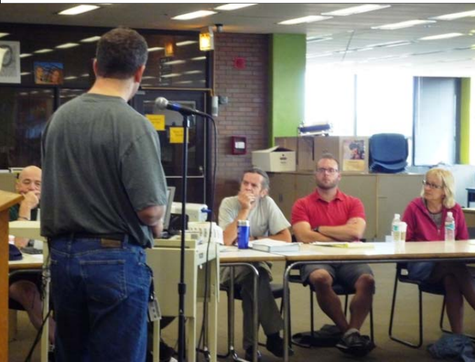
Here are what we need to do...