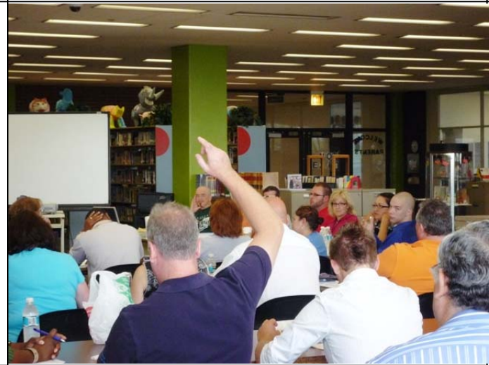
How to help our students prepare for College admissions?