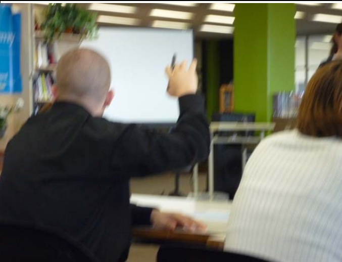
Participating, suggesting, proposing...