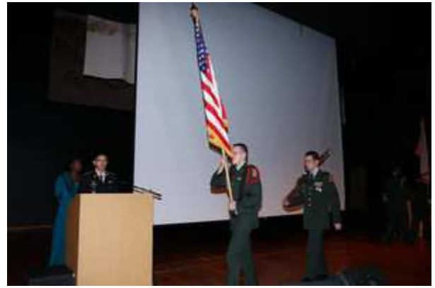
Welcome to the WSHC Open House & Clemente JROTC Cadet Presentations