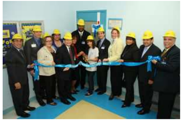
The WSHC Ribbon Cutting Ceremony