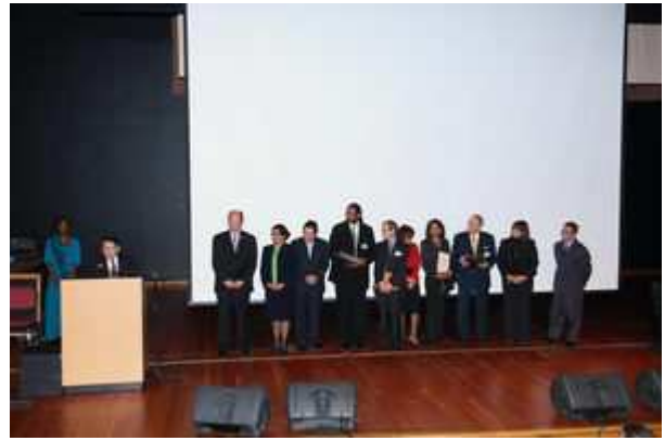
The WSHC Leadership Changeover Ceremony